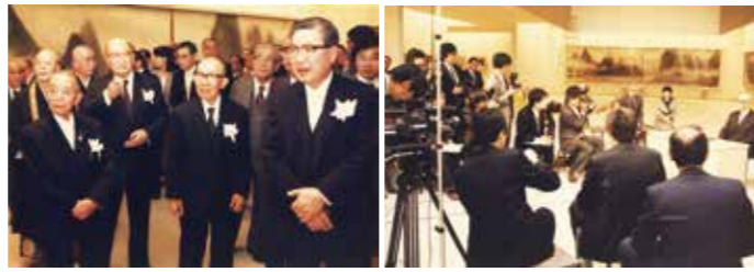
[Fig. 1] The Opening of the Higashiyama Kaii Gallery: Higashiyama Kaii (center) at the Opening Reception [Fig. 2] The Opening of the Higashiyama Kaii Gallery: Higashiyama Kaii (seated on right) at the Press Conference