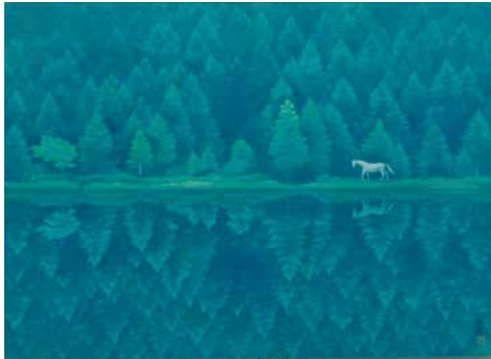
[Fig. 3] Vibrant Green, 1982