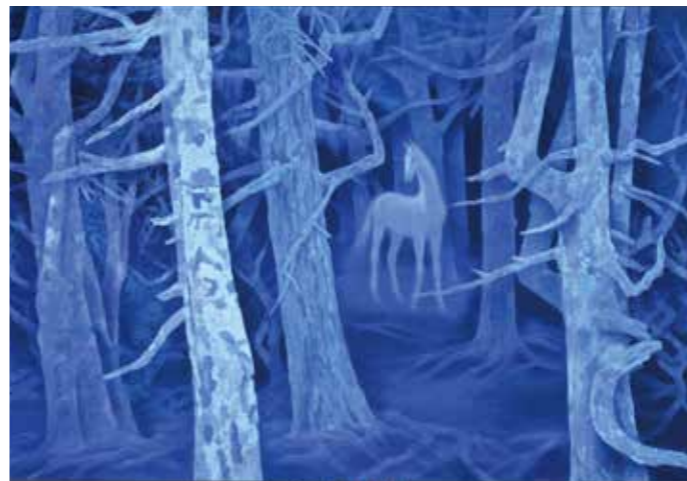
[Fig. 8] Forest with a White Horse, 1972

Term VI. Thu, Feb 4, 2021 – Tue, Mar 30*tentative