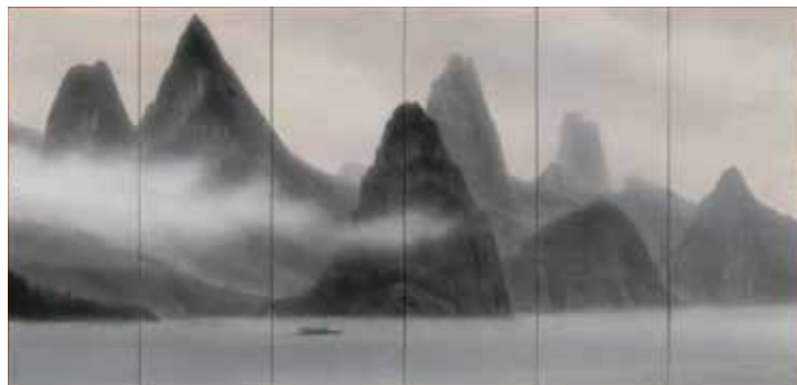
[Fig. 4] Lijiang at Twilight, 1978

Term III. Thu, Jul 30 – Tue, Sep 22 (Nat. Hol.)