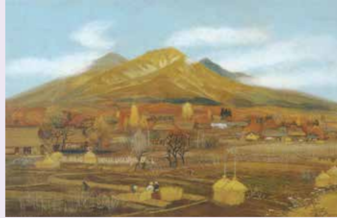
[Fig. 6] Autumn in the Mountainous Country, 1928, Hyogo Prefectural Museum of Art

Term IV. Special Exhibition Celebrating the 30th Anniversary of the Opening of the Higashiyama Kaii Gallery: Setting Out to Japanese-style Painting Fri, Sep 25 – Mon, Nov 23 (Nat. Hol.)