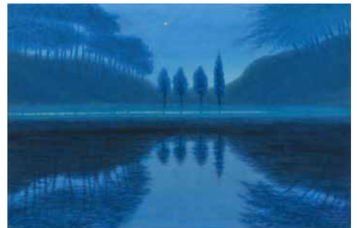
[Fig. 9] Evening Star, 1999

Term VI. Thu, Feb 4, 2021 – Tue, Mar 30*tentative