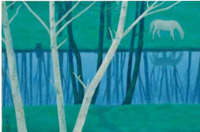
[Fig. 5] Grass Turned Green, 1972

Term III. Thu, Jul 30 – Tue, Sep 22 (Nat. Hol.)