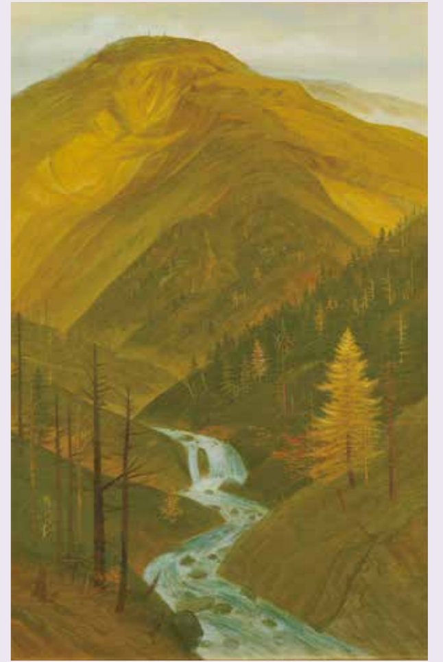
[Fig. 7] Mountains in Autumn Colors, 1932

Included in our collection are many early sketches not found elsewhere and underdrawings and studies made in order to complete paintings. This exhibition focuses on Higashiyama's young days when he started out as a painter. How did Higashiyama "Shinkichi" become Higashiyama "Kaii," a leading artist of contemporary Japanese-style painting? By exhibiting works such as Autumn in the Mountainous Country (Study) (Hyogo Prefectural Museum of Art), which Higashiyama submitted while studying at Tokyo Fine Arts School to the Teiten (Exhibition of the Imperial Academy of Fine Arts) for the first time and which was accepted for the first time, and Mountains and Sea (The Suiboku Museum, Toyama), which demonstrate his quest for expression in his young days, we shall examine how Higashiyama Kaii started out on his artistic career.